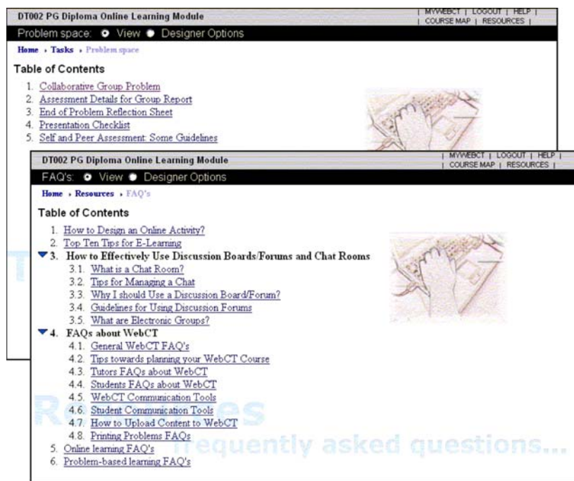
Figure 1. Shows two screen-shots of the blended PBL module in the virtual learning environment 'Webcourses', one showing the problem/task space and the second illustrating a selection of the virtual resources.

Figure 2 shows the blended PBL tutorial process as discussed in this study at the centre of the transformative learning cycle which participants experienced. The tutorial process consisted of the traditional PBL steps of problem-solving, self-directed learning, critical discourse and reflection and communal knowledge construction. A blend of face-to-face, computer-mediated conferencing (CMC) and video conference (VC) events, preceded by an online pre-induction session which all the participants experienced, prompted a series of stages leading towards transformative learning. These stages were activating events, articulating assumptions, critical self-reflection, engaging in discourse and testing and applying new perspectives.