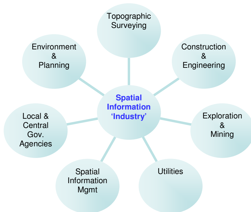
Fig. 2. Components of the Irish spatial information industry

These economical and social issues are attributable, among other factors, to Ireland's EU membership, access to the Single Market, our low corporation tax rate, a large multinational presence, a high proportion of the population of working age, increased participation in the labour market especially by females, a reversal of the trend of emigration toward immigration, a more stable public finance position, and co-ordinated social partnership agreements between Government and trade unions. Significantly however, this transformation towards a 'knowledge economy' was underpinned by sustained investment in education and training by the State over the last 15 years. The spatial information components of that economy (Figure 2) are now an intrinsic part of the Irish success story to date and the demand for skilled graduates into the future, nationally (and globally), is predicted to continue.