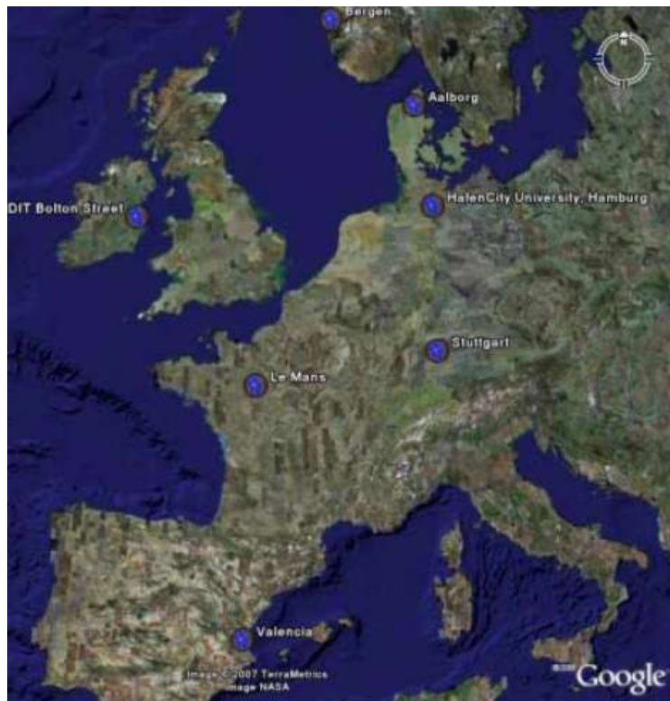
Fig. 6. ERASMUS links of the Department of Spatial Information Sciences, DIT

Through the ERASMUS programme, DIT is now linked to 6 European universities across 5 countries (Figure 6). These links have facilitated lecturer exchange programmes (Aalborg and Stuttgart), student exchange (Le Mans, Hamburg & Valencia), joint supervision of research students (Stuttgart), and student visits (Bergen & Hamburg), all of which have been very valuable to the taught and research agendas of the department.