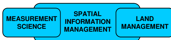
Fig. 3. Educational profile of the future for surveyors recommended by FIG and CLGE [Enemark 2001]

The undergraduate bachelor degree in Geomatics is a National Qualifications Authority of Ireland (NQA) Level 8 qualification [RE1 07]. The duration is for 8 semesters (Figure 4) and it attracts 240 ECTS credits. This degree is unique on the island of Ireland, and has produced 109 graduates in its first 5 years since 2003.