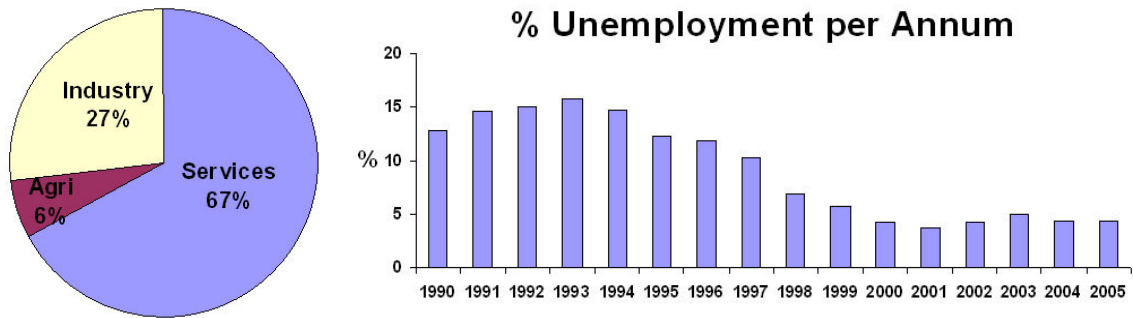
Fig.1. Irish economic profile & unemployment trends

These economical and social issues are attributable, among other factors, to Ireland's EU membership, access to the Single Market, our low corporation tax rate, a large multinational presence, a high proportion of the population of working age, increased participation in the labour market especially by females, a reversal of the trend of emigration toward immigration, a more stable public finance position, and co-ordinated social partnership agreements between Government and trade unions. Significantly however, this transformation towards a 'knowledge economy' was underpinned by sustained investment in education and training by the State over the last 15 years. The spatial information components of that economy (Figure 2) are now an intrinsic part of the Irish success story to date and the demand for skilled graduates into the future, nationally (and globally), is predicted to continue.