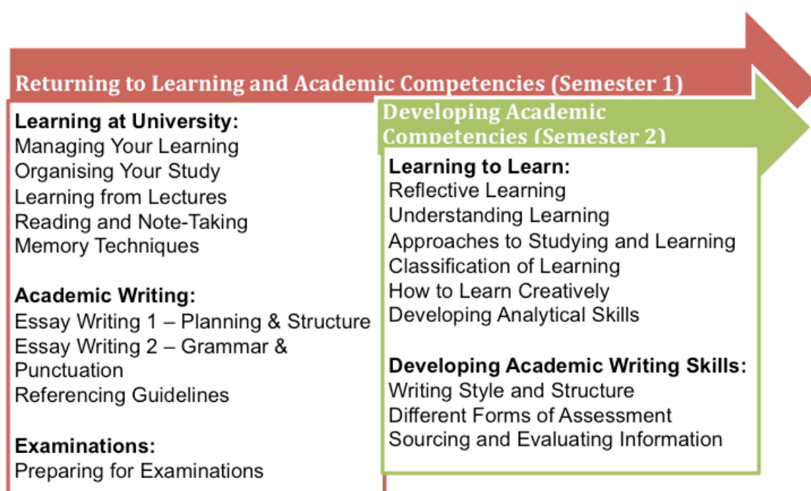
Figure 1: Academic Skills – Module Content

of students' academic writing skills across the entire degree programme. Figure 1 presents an overview of the module content.