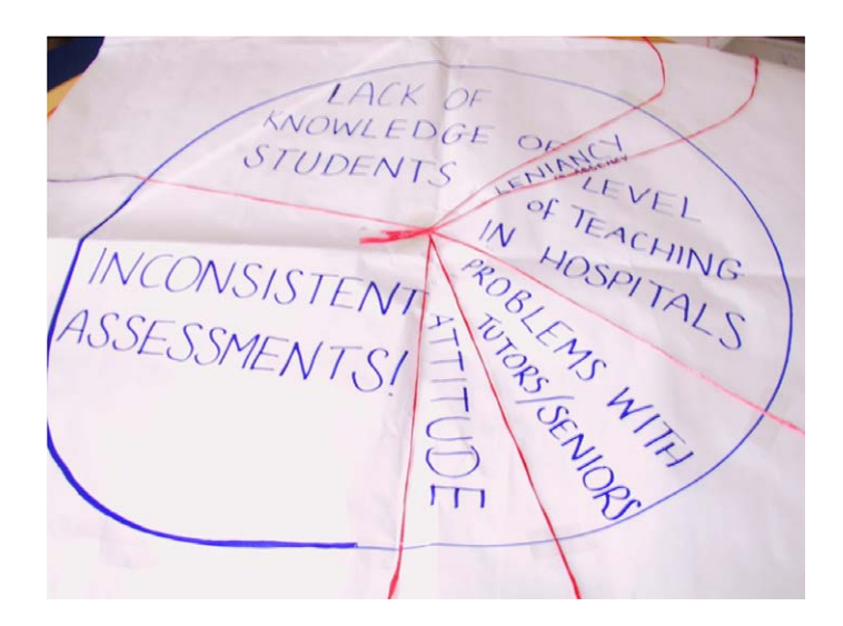
Figure 2. Example of a pie chart from one group.

Data collection, analysis, action and dissemination in PRA are part of an iterative process. Some results gathered on the day in the initial process, such as the pie