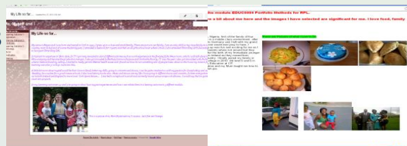
Fig 1. sample e portfolios