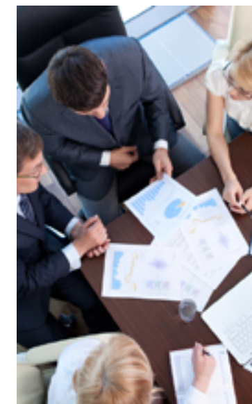
Key supervisor responsibilities should be highlighted in the workshop

As Structured PhD programmes are still relatively new in many institutions, it is important that the general principles governing such programmes in the institution are described, including information on generic and transferrable skills training and advanced discipline-specific modules and their accreditation. Information on the input of graduate