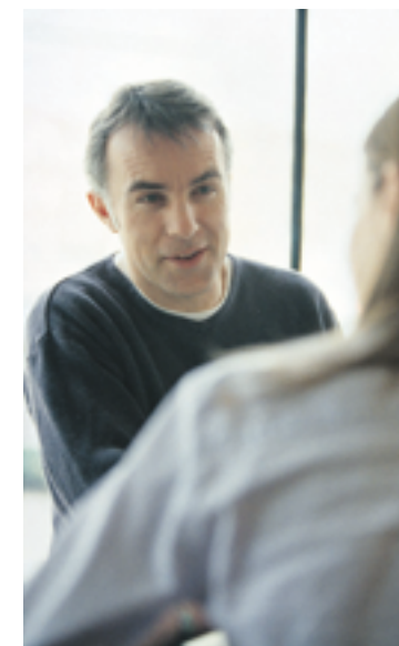
Minimum lecturing content, maximum use of discussion

An agreed division of elements to be developed and piloted in each partner institution was agreed to allow eventual sharing of materials and experience between partners, and joint collaborative initiatives. Added value was a natural consequence of the collaborative nature of the project across so many institutions.